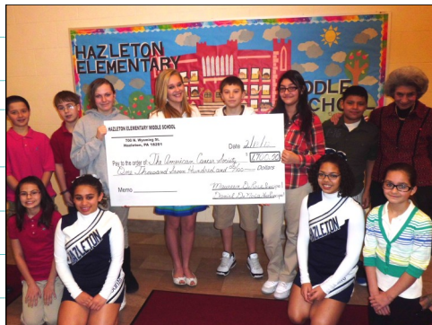
HEMS student reps present check to ACS

DeLuca: The student council is very happy to make this donation to this