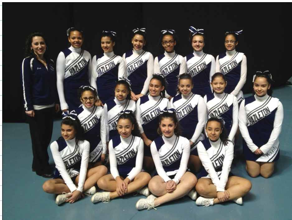
2011-2012 Hazleton Mountaineer Cheerleading Squad at the Keystone State Cheerleading competition at Penn State University in State College, PA

Tryouts are at the Ninth Grade Center and are three days long. To be a cheerleader in the HASD you must be available during the summer months to practice. Therefore anyone going away for the summer will not be eligible.