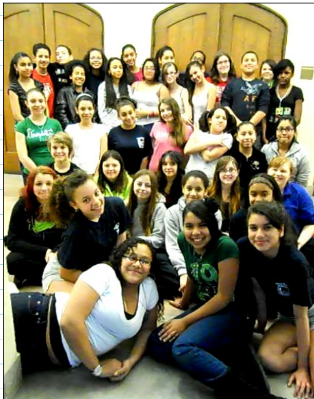
The cast of The Hysterical History of the Trojan War poses for a group photo outside of the auditorium in February.